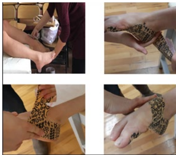
Fig. 2. Dynamic® tape application.

Dynamic® Taping. Taping was applied by a certified physiotherapist with original Dynamic® tape, 5 cm wide. The arch support technique was used as a taping method. For the taping procedure, the athletes were required to sit steadily in a reclining position with feet and ankles free in space and ankles at plantar flexion and inversion, forefoot at adduction, and hallux at flexion. The tape was applied as one piece in an 'I' shape on hairless skin already cleaned with alcohol. Taping began from the plantar surface of the hallux proximal phalanx with zero tension in the first anchor section with a width of 3 or 4 toes. Then the tape was stretched towards the mediolateral calcaneus of the sole and wrapped around the posterior of the calcaneus, from which it extended obliquely onward to include the navicular tubercle from the lateral to the mid-plantar section of the foot. Finally, zero tension was applied on the anchor section of 3- or 4-toe width in the dorsum of the foot, towards the distal part of the ankle (Figure 2). Maximum tension was applied on the tape as it crossed the navicular tubercle [10].