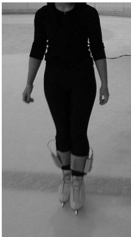
Fig. 1. A participant wearing the F-scan in shoe pressure system with cuffs attached about the lower shanks

Metatarsal Head (4&5MTH), 6 = Medial Arch (MA), 7 = Lateral arch (LA), 8 = Medial Calcaneus (MC) and 9 = Lateral Calcaneus (LC). Pressure and force data were reported for each area (Fig. 2).