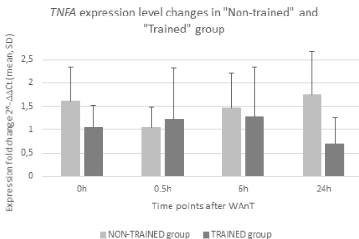
Fig. 1. TNFA expression level changes in "Non-trained" and "Trained" group in four post-tests after WAnT

A direct comparison of the TNFA expression levels measurements between the "Non-trained" and "Trained" group in four post-tests after WAnT revealed that TNFA transcript levels measured immediately after WAnT (time point 0h) as well as 6h and 24h after WAnT were higher in non-trained participants ("Non-trained" group) when compared with trained soccer players (the "Trained" group). Only in the second post-test after WAnT (time point 0.5h) the expression of TNFA was slightly higher in the "Trained" group (Fig. 1).