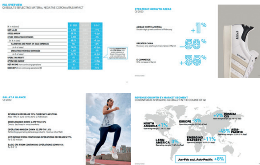
Fig. 2. Scan of crucial economic parameters from the financial statement for the 2020 fiscal first quarter results published by Adidas AG [11]

The results of Manchester United PLC are not as bad as the 2020 fiscal first quarter results of Adidas company, one of the leading producers of sports clothing and accessories in the world. In February and March 2020, the Chinese government decided to freeze the country's economic activity; in March, a similar action started in Europe. As a result, Adidas net sales in the 2020 fiscal first quarter decreased by 19% year-on-year. It was -45% in the Asian market and -58% in the Chinese mainland. Adidas operating margin, which is essential in retail, declined to 1.4%. Along with the decrease in net income from continuing operations in the traditional sale channel, it provoked a decline in the company's profitability by 97%. The increase of e-commerce by 35% improved the situation; however, on-line shopping was unable to compensate for the losses. Taking into consideration the future events, the spread of the COVID-19 pandemic in April and May in North America and Great Britain, which are the biggest sports markets, and European and Chinese markets' slow return to function, similar or worse results year-on-year should be expected in the second quarter of this year.