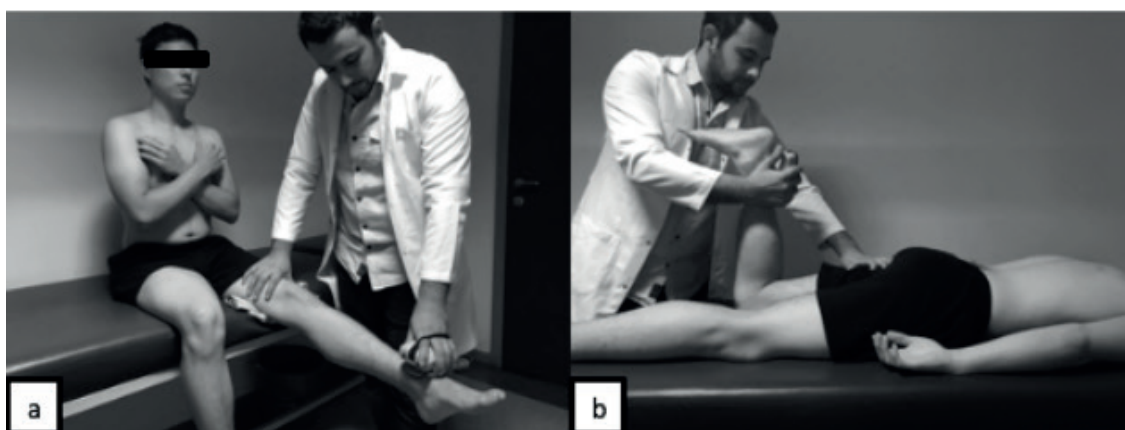
Fig. 1. Knee flexion and extension

Swimmers were positioned prone for knee flexion (FL), ankle plantar (PLF) and dorsi flexion (DFL) muscle strength measurement. For the knee flexion measurement, the limb on the measured side was positioned at 90 degrees flexion. The swimmers were asked to apply the maximum force in the opposite direction to the resistance of the researcher who made the measurement (Figure 1a-b).