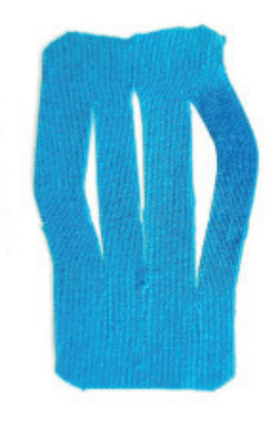
Fig. 11. Slit-shaped cutout

In the slit-shaped cutout the tape is cut in the middle into four or more pieces. It is applied in order to achieve an analgesic effect in the case of knee, elbow, and joint injuries, as well as in scar therapy and muscle imbalance (Fig. 11).