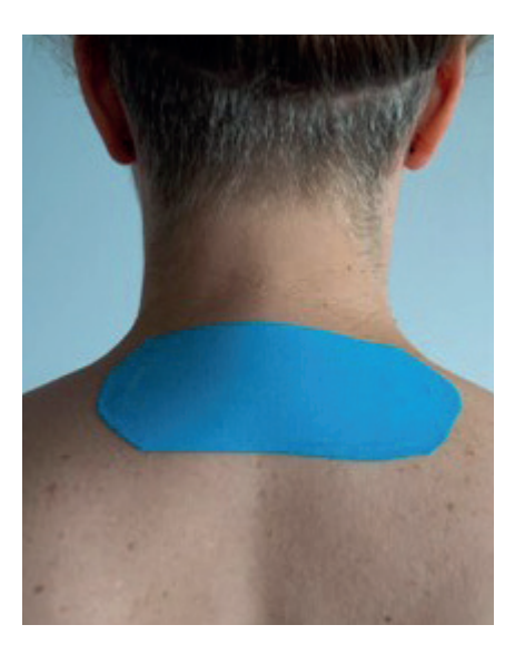
Fig. 2. Ligament technique

An I-shaped cutout. The main function of this technique is the lifting effect it has on the ligaments. Its main feature is the maximum degree of stretching in the central part of the tape (100%), whereas the ends are applied without any stretching. The goal of this technique is to stimulate mechanoreceptors (Fig. 2).