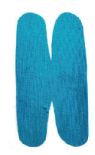
Fig. 9. X-shaped cutout

X-shaped cutout is used for muscles with several sides, affecting two joints (Fig. 9).