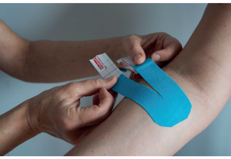
Fig. 3. Fascial technique

A V-shaped cutout. The purpose of this technique is to correct the positioning of fascia. The tape alleviates pain while the patient is moving. Typically, the applied tape is V-shaped. The 2 cm base of the tape should be applied without any tension, whereas both ends should be applied with a tension of about 25% (Fig. 3).