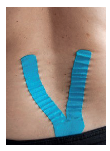
Fig. 1. Muscle technique

This is the most commonly used physiological technique. It is known that it supports or weakens muscle work. The applied tape should be unstretched, forming convolutions which lift the skin. The tape must be placed at a maximum distance from tendons. Exceptions may be made if the patient experiences pain resulting from their inability of assuming such a position (Fig. 1).