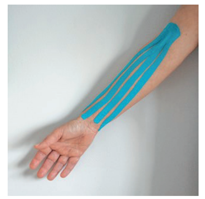
Fig. 5. Lymphatic drainage technique

It is implemented to reduce swelling and to improve proper lymphatic circulation. The Kinesio tape is cut into 4 parts in order to cover the swollen area, using approximately 10% of the tape's tension (Fig. 5).