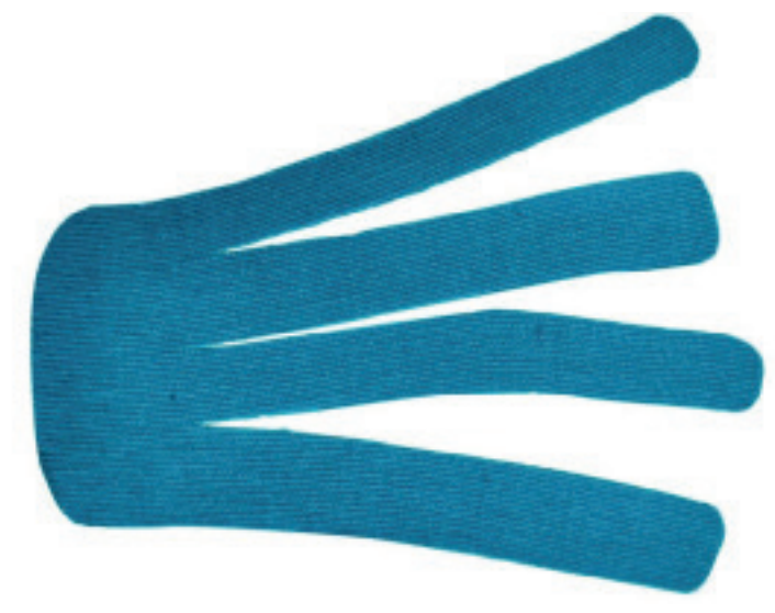
Fig. 10. Fork-shaped cutout

Fork-shaped cutout is colloquially called 'a fork'. An I-shaped strip is cut lengthwise into three pieces on one side of the tape. It is commonly used in lymphedema management or for superficial contusions and swelling (Fig. 10).